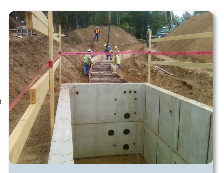
Crews work on an underground duct bank extending from a typical 8'x8'x24' vault.

Overhead lines are air cooled and widely spaced for safety. Underground cables are installed in concrete encased PVC duct banks. Heat generated by the cables is dissipated into the earth.