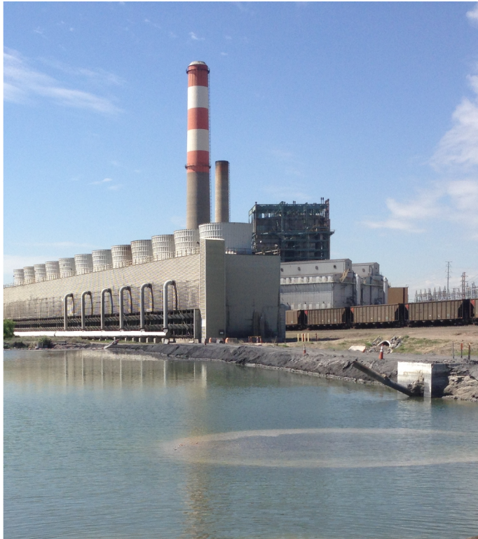
Cherokee Station, Denver, Colorado