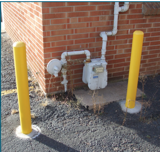
EXAMPLE OF COMMERCIAL BOLLARDS

On behalf of Xcel Energy, Q3 Contracting is working to ensure that natural gas meters throughout the state are protected from vehicular damage. The natural gas equipment on your property is designated for bollard protection as determined by our standards and required by federal regulation. While Xcel Energy and Q3 Contracting crews are permitted by law to work on your property, we want you to know what to expect.