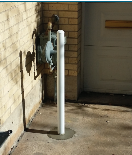
EXAMPLE OF A RESIDENTIAL BOLLARD

While most of the gas system is underground, some equipment is not, such as gas meters. In instances where gas meters are within five feet of a driving surface, federal code and company standards require the installation of protective devices. This involves the installation of 2-4 inch diameter metal poles filled with concrete. Referred to as bollards, these reduce the risk of vehicular damage to the gas meter, which could result in an unsafe situation.