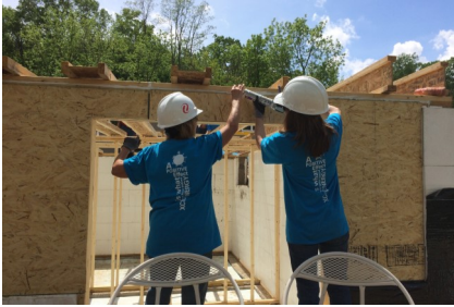
Xcel Energy employees volunteering for Habitat for Humanity.

Xcel energy generates 55 percent of its Upper Midwest electricity using carbon-free generation. Thirty percent of that generation is from its two nuclear plants in Minnesota, 15 percent is from wind energy, and 10 percent is from a combination of hydro/biomass/solar sources. Beyond its nuclear program, Xcel Energy has been the number one utility provider of wind energy for 12 straight years.