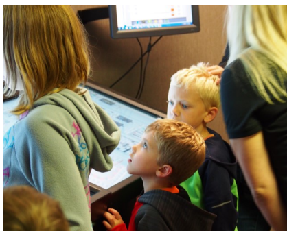
Children using Monticello mobile simulator at open house event.

In addition to the economic benefits that Xcel Energy's nuclear operations contribute to Minnesota in the form of jobs, income and taxes, the company and its employees contribute to local communities in many other beneficial ways. Xcel Energy strengthens Minnesota communities through hiring veterans, charitable contributions, educational programs that teach and promote the benefits of nuclear energy, environmental programs that improve the quality of the environment, and civic engagement activities that build trust and goodwill.