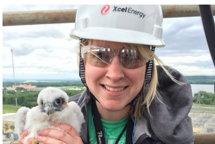
Xcel Energy employee holding a Peregrine Falcon chick.

Like all nuclear power plants, Monticello and Prairie Island produce carbon-free electricity. Nuclear power produces 62 percent of the United States' carbon-free electricity and nearly 20 percent of total electricity generated. Hydro, wind and solar produce 19, 15, and 2 percent of carbon-free electricity, respectively. Nuclear power plants avoided 564 million metric tons of carbon dioxide in 2015, while hydro, wind and solar avoided 327 million metric tons combined. Annually, the avoided emissions from nuclear power is similar to adding 128 million cars to the nation's roads. Nuclear power plants also avoided hundreds of thousands of tons of nitrogen oxide and sulfur dioxide. The Environmental Protection Agency estimates that the Clean Power Plan will reduce carbon emissions by 414 million tons annually by 2030, or 73 percent of current carbon avoidance of the nuclear industry.