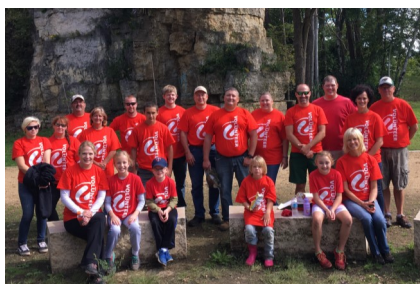
Prairie Island employees volunteering at Red Wing Memorial Park.

Below are further examples of contributions of Xcel Energy and its employees: