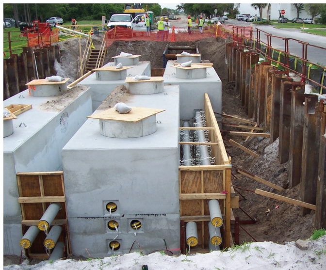
Underground transmission line construction

The biggest difficulties with burying lines are cost and the time required to make repairs if there are failures. An equivalent underground line can cost 10 to 15 times more than the amount of an overhead line, and it creates technical and operational challenges. Significantly more time is necessary to locate and diagnose a problem on an underground line, and repairs can disrupt service for several weeks. Installing underground lines also can have a considerable environmental impact.